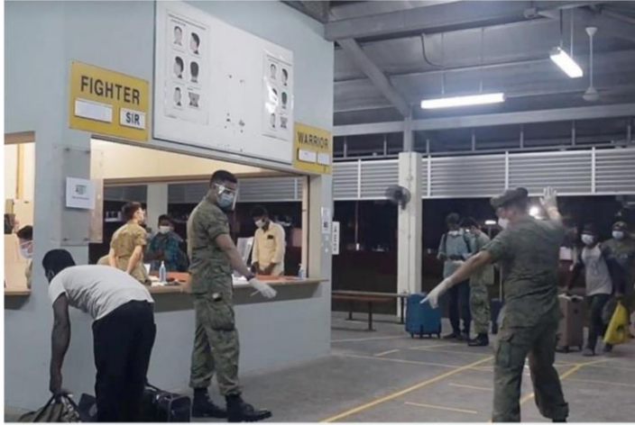
About 1,300 workers will move into two Singapore Armed Forces camps from this week, said the Ministry of Defence on Facebook last night.