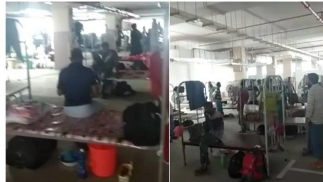
Screenshots from a video showing migrant workers living at a car park.